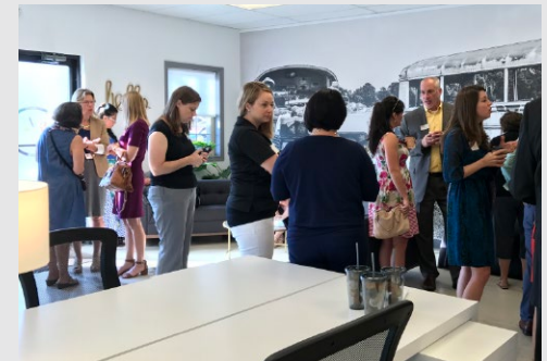
Members networking at the Viscul Creative Mixer on August 9th at their location in Dillsburg.

Have someone that you think would be a great addition to the West Shore Chamber and would benefit from our resources? Membership Committee would like to remind you about the Chambers Member Referral Program, when you refer someone and they become a member you both get a gift!