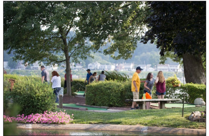
Attendees of Putt It Into The Park enjoying mini golfing at Water Golf on City Island at the start of the event.

A big thank you to our event partners Water Golf on City Island and the Harrisburg Senators for use of their locations for this event. Another thank you to all our sponsors for making this event possible: Orrstown Bank, OSS Health, Capital BlueCross, Waddell & Reed, Prudential Advisors, AllBetterCare Urgent Care Center and Jameson Law Firm LLC.