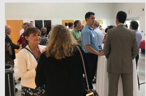
Members of the Mechanicsburg and West Shore Chambers networking at the United Methodist Home for Children Mixer on August 15th.